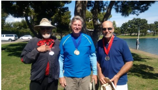
May Points Race - ODOM Winners