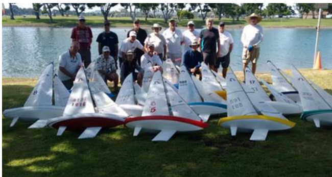
2015 Soling-50 NCR Race Week Participants

Of the some 45 or so registered Soiling 50's nationwide, we have 24 of them right there in the Argonauts. But many members have not yet participated in a NCR event. There are good reasons: Conflicts of schedule, it is a two day event and that's a lot of walking, and it's a bit intimidating. OK, I get it. But it is also a lot of fun and the best way to improve your skills. With Points Races there are only 3 races, that just barely gets you started, especially if something goes wrong. In a two day event, there are a lot of starts (24), more competitors (i.e. more to beat if you get the chance) and you can learn from mistakes and try again in the next race. If your feet get tired just sit out a race. Nothing says you have to race every race. With 24 races there will most likely be 4 throw outs. So come give it a try and just have fun!!